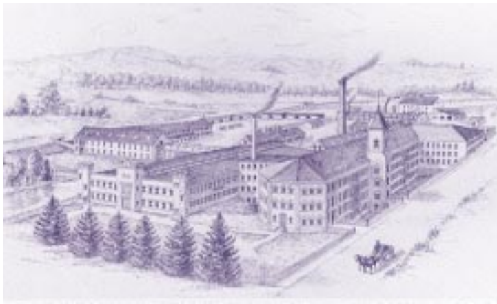
Whitin Machine Works, as it looked in 1879. At its peak in 1948, the complex employed over 5,600 men and women.

The tour takes about one and one-half hours.