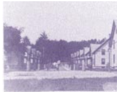
These houses for Whitin employees were built in 1826. Workers with higher status in the mill enjoyed larger, more attractive living quarters than those with lower rank. Eventually, the town contained more than a dozen clearly differentiated levels of housing.

The remainder of the workers' houses on Fletcher Street were built in the 1840s, in conjunction with the granite Cotton Mill.