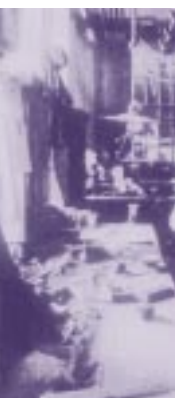
Loom fixers at work. Rent for Whitin company houses in the 1860s ranged from $3 a month for an unskilled worker's multi-family house to $12 a month for a single family upper-level manager's house. The average weekly pay was around $6.60 for a 60-hour week.

Turn left onto Main Street and you will immediately come to the imposing Whitin Machine Works.