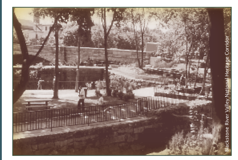
Valley Falls Heritage Park has been one of the most popular relaxation sites in Cumberland since its opening in 1993.