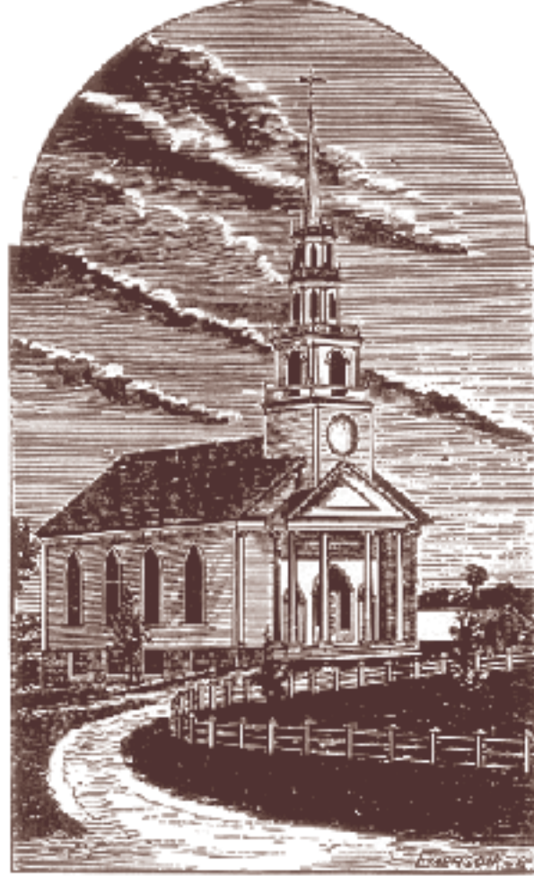
When Sutton's original meetinghouse (on the Common's west side) was replaced in 1751, the new building (on the Common's south side) retained the secular style of its predecessor. In the 1790s, however, a church tower was added, marking the trend toward separate buildings for religious and political affairs. After a fire destroyed that building, the present "church-like" structure was erected (on the east side of the Common) in 1830.