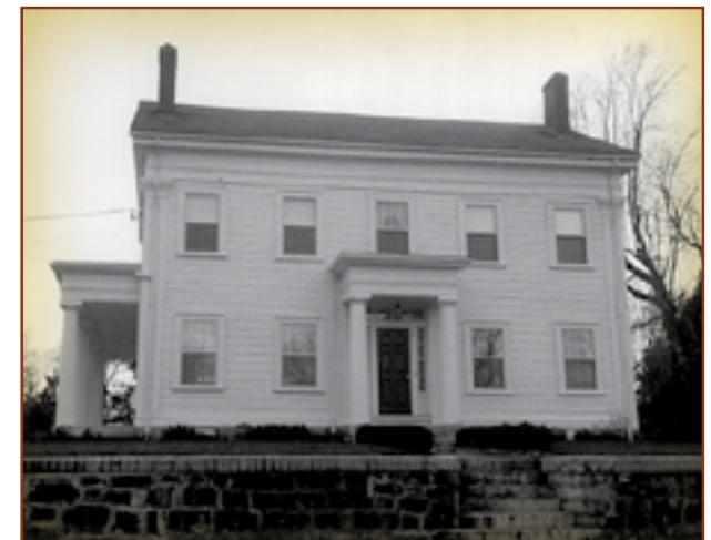
Dr. Elisha Bartlett House