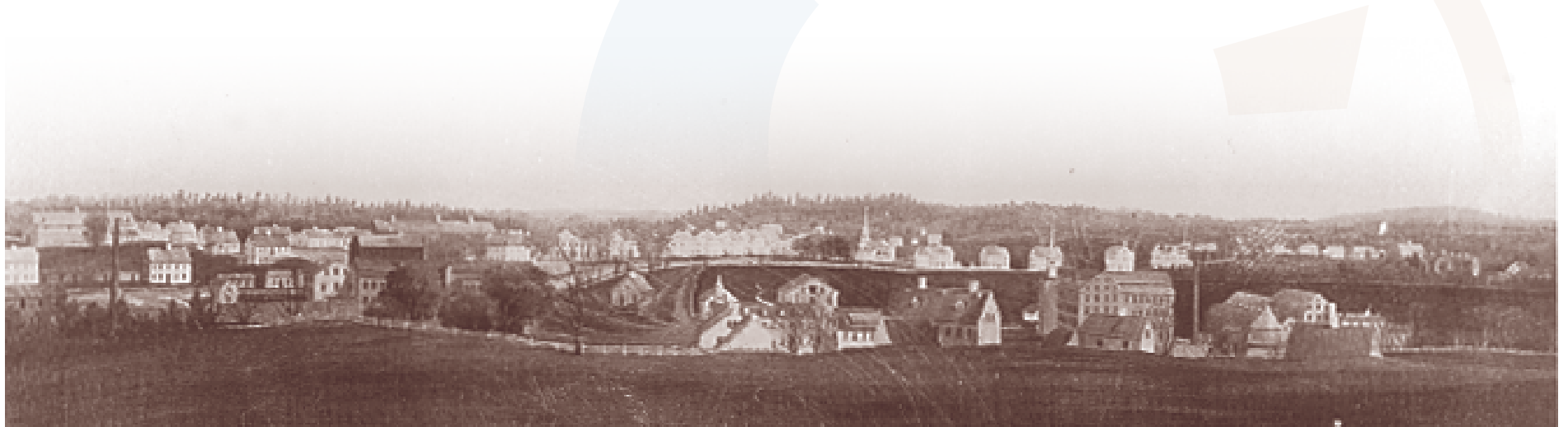
View of Slatersville c. 1860, looking north from Tabor Hill. The Center Mill can be seen in the right foreground. In the background is Main Street and School Street, including the First Commercial Block and the Congregational Church.

The current residents still exhibit the sense of pride instilled by the Slaters and Henry Kendall. While the surrounding areas have been developed, the village core has been preserved and Main Street looks much as it did in the 1920's after Kendall's renovations. Thus modern Slatersville is not only a mill village entering its third century, but the end result of a preservation project that has been lovingly carried out on a community level for eighty years.