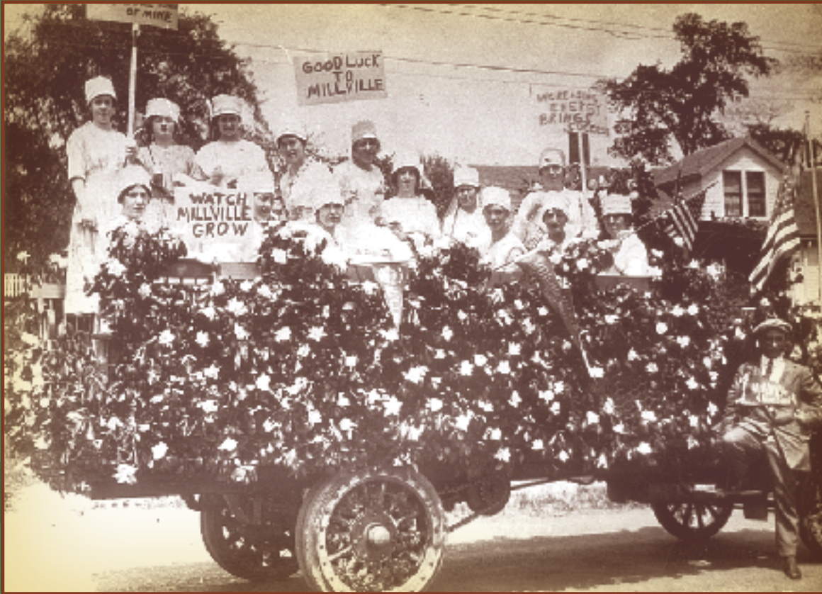
The Separation Day Parade.