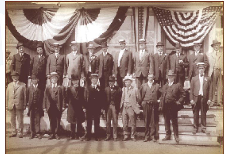
Millville's Separation Committee on May 31, 1916. Notice the different suit styles. Only one gentleman chose not to don a hat that day on the parade reviewing stand.