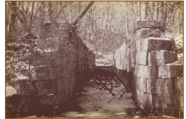
Clues to Millville's past are all around us – this short "above-ground" archaeological expedition shows you what to look for. Along almost every swift-moving waterway in New England, evidence of early industry has been found—the Blackstone River through Millville is no exception.

Today, the families who live along Millville's quiet side streets and miles of winding country roads enjoy the secure residential lifestyle of their community. No one doubts Millville will always maintain the one feature it has cherished since the day of the great parade in 1916—its own identity.