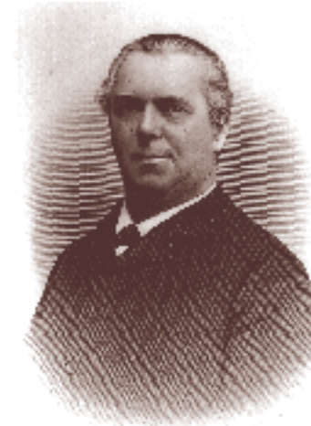
The Rhode Island Historical Society