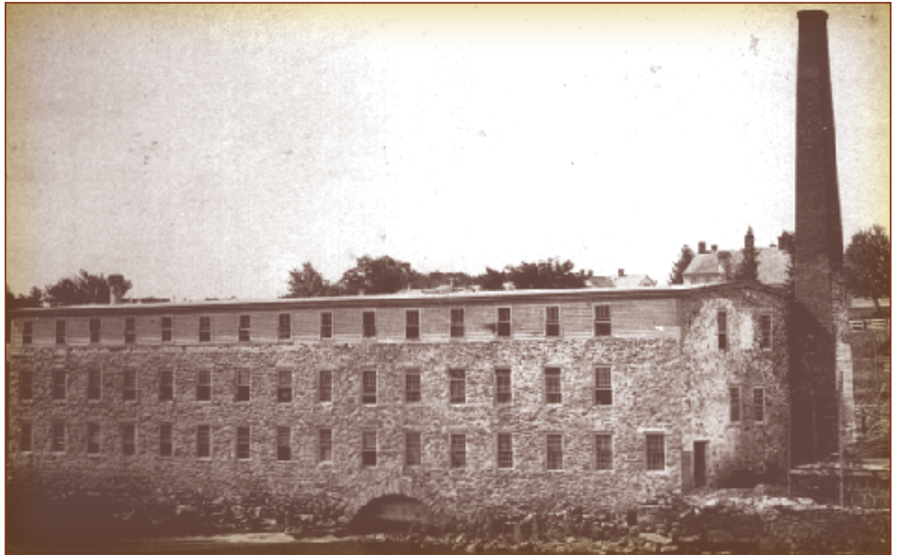
The John Scott Woolen Mill, Millville, demolished.

Begin the second loop at the visitor's parking area by turning right on Central Street. As you walk down to the riverbanks, you are following in the footsteps of Millville's laborers on their way to work in the mills and factories along the Blackstone River.