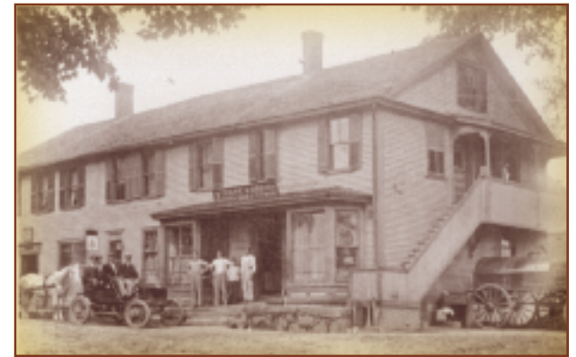
This 1830s commercial block once housed the town's post office.

Many people enjoy an afternoon in the Old Cemetery because of its interesting art and epitaphs such as this one: My children dear, this place draw near, a mother's grave to see. Not long ago I was with you, and soon you'll be with me.