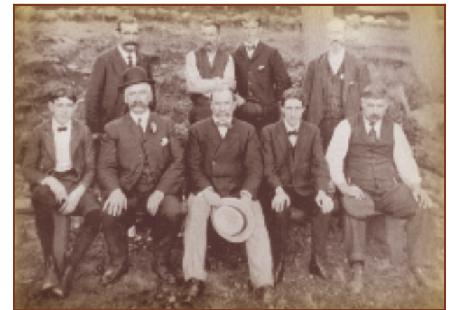
Nipmuc Park employees around the turn of the century.