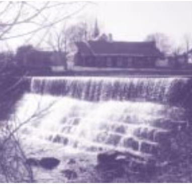
Above the falls, The Assembly and Jesse N. Smith Library.

The Stillwater House was a tavern in the 1840s, and later a boarding house. After 1919, the Stillwater Company bought it to use as a community center and dance hall. The building has been rehabilitated into apartments.