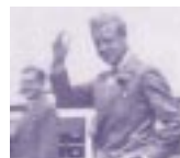
The Stillwater News , October 15, 1944 On Friday August 19th, His Royal Highness Duke of Windsor, visited Burrillville...

The Town Office building and the now attached Ninth District Court building were two other components of the mid-1930s Town Buildings Project.