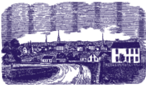
Grafton Center, from South Street, in 1839.

A lack of waterpower at Grafton Center allowed the center to develop into what it is today. Grafton investors built mills on the Blackstone and Quinsigamond rivers, creating new village centers in Fisherville, Farnumsville, Saundersville, Kittville, Centerville and New England Village. Each of these villages has its own fascinating story to tell, but it is also important to recognize how