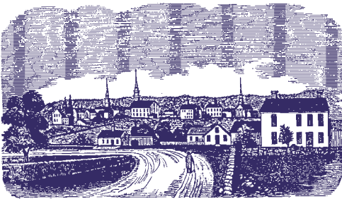
Grafton Center, from South Street, in 1839.

A lack of waterpower at Grafton Center allowed the center to develop into what it is today. Grafton investors built mills on the Blackstone and Quinsigamond rivers, creating new village centers in Fisherville, Farnumsville, Saundersville, Kittville, Centerville and New England Village. Each of these villages has its own fascinating story to tell, but it is also important to recognize how