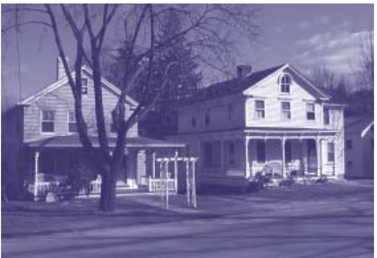
The handsome "50¢ houses" along the East Side of South Street, once the site of shoe mills and worker tenements, stand in stark contrast to the grandeur of the mill owner homes located across the street.

As you look down South Street, the economics of the leather industry can be readily seen. To your right on the west side of the street stand the impressive homes of many of the boot shop owners. Across the street to the east are many of the old shops, now converted to housing, along with the tenements that housed the workers. Locals often speak of these as the "dollar houses and the 50¢ houses."