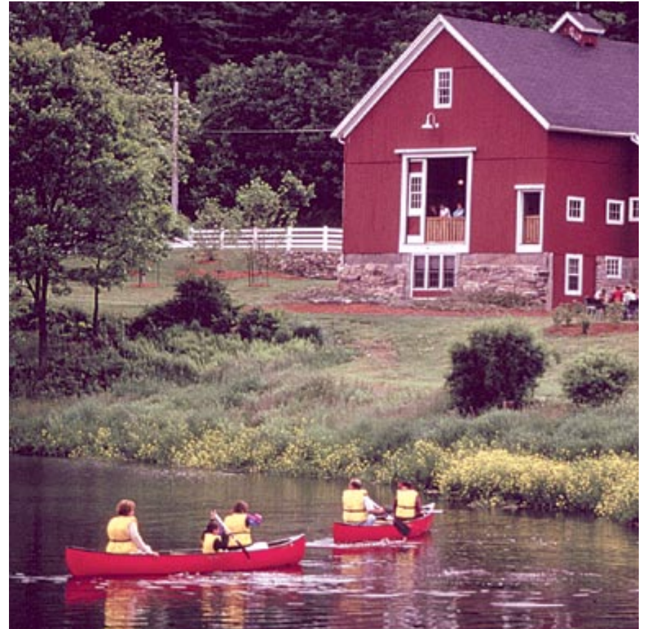
photo of River Bend Farm

The industrial history of the Blackstone Valley can be attributed to the power of the Blackstone River. While in most places the river is narrow and shallow, the power of its water flow should never be taken for granted. During times of heavy rain or major snow melt, the water level of the river will rise quickly, significantly increasing its speed and presenting new obstacles for paddlers. In high water, strainers or sweepers are common along the banks of the Blackstone and require the paddler's full attention. All levels of paddlers need to respect the power of the river and be aware that the water flow can fluctuate wildly over a short period of time, quickly creating challenging conditions. Please wear a Personal Flotation Device (PFD) at all times when paddling the Blackstone River. Paddlers should check the water level,