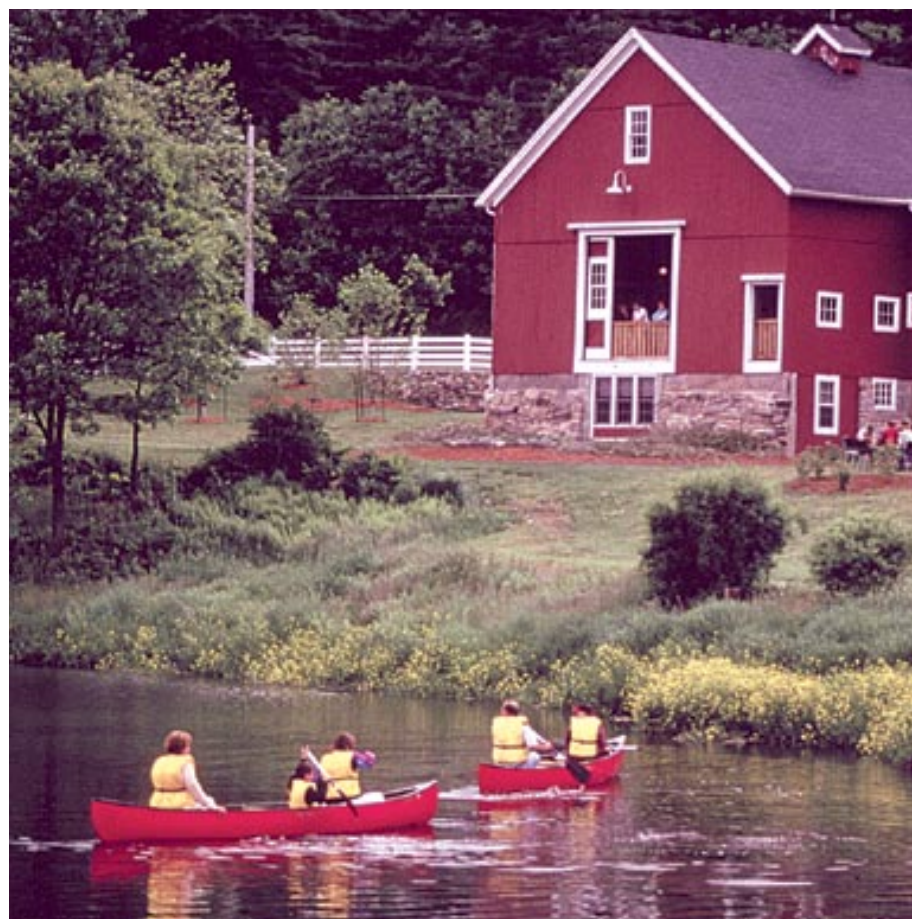
photo of River Bend Farm

Flat water paddling is characterized as water with very little current and no major obstacles. Paddling on the many mill ponds created by the dams along the river and in the Blackstone Canal are good examples of flat water paddling. Quick water is characterized as either Class I or Class II based on the International Scale of River Difficulty. A Class I river has a current with a few riffles and small waves and paddlers run into few or no obstructions. A Class II river will have easy rapids with waves up to 3 feet high and wide clear channels. Some skills to safely maneuver your boat are required. Tours in the Water Trails Guide will be on portions of the river classified as either Class I or Class II. However, significant maneuvering is required through the flood plain of the Blackstone due to numerous horseshoe bends and S-curves that are prevalent throughout most of the Massachusetts section of the river. The river begins to get broader and flatter beginning in the South Uxbridge section of the river and through Rhode Island. This is a diverse yet intimate river full of surprises for paddlers. Enjoy your trip as you discover why the Blackstone River was once called "America's Hardest Working River"!