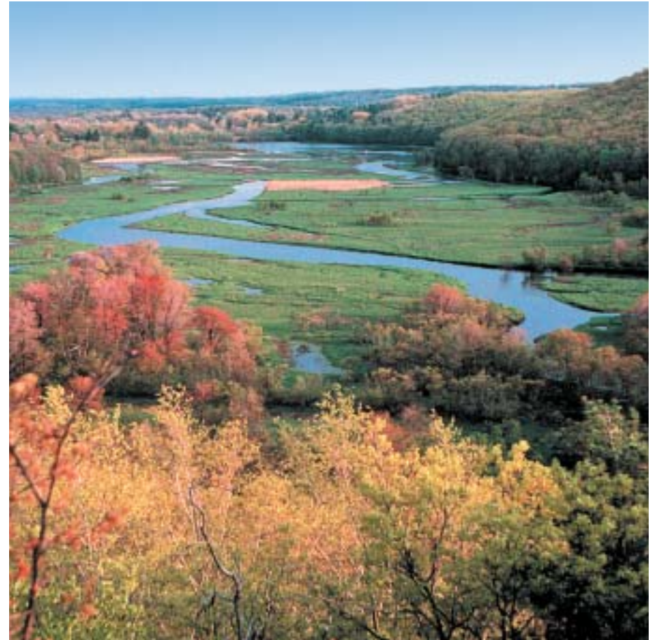
photo of view from Lookout Rock

The industrial history of the Blackstone Valley can be attributed to the power of the Blackstone River. While in most places the river is narrow and shallow, the power of its water flow should never be taken for granted. During times of heavy rain or major snow melt, the water level of the river will rise quickly, significantly increasing its speed and presenting new obstacles for paddlers. In high water, strainers or sweepers are common along the banks of the Blackstone and require the paddler's full attention. All levels of paddlers need to respect the power of the river and be aware that the water flow can fluctuate wildly over a short period of time, quickly creating challenging conditions. Please wear a Personal Flotation Device (PFD) at all times when paddling the Blackstone River. Paddlers should check the water level, weather, and river conditions prior to every trip. For more information on this see the "Contacts" section.