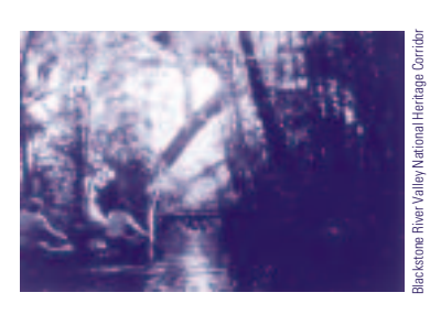
Activities in Lincoln are not limited to Great Road. Here are some canoeists enjoying a ride through the Blackstone Canal at the Blackstone River State Park. The Blackstone is a popular destination for canoeists and kayakers. For more information and suggested tours, please see the "Get on the River" page of our website.

Follow Great Road to the right for about 2 miles. About 1/10 of a mile past Central Elementary School is the Mowry Tavern on the left, next to the horse farm.