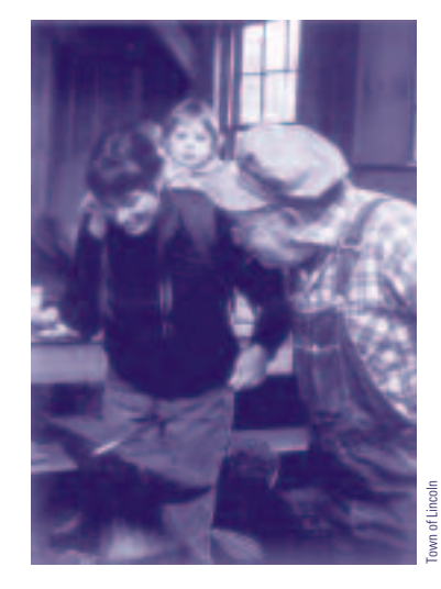
Modern blacksmith demonstrating the old techniques at Hannaway's Blacksmith

Adjacent to the Chase Farm is the Hannaway Blacksmith Shop. Originally