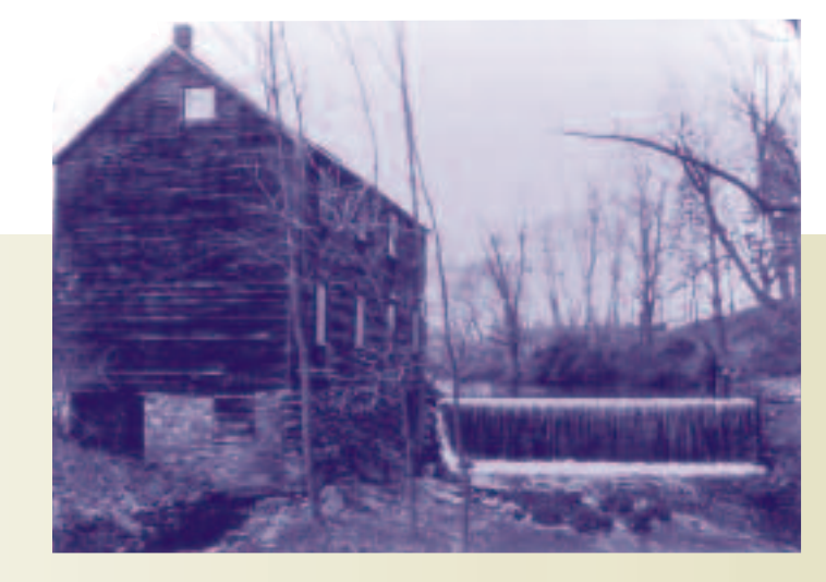
Travel through three hundred years in three miles.