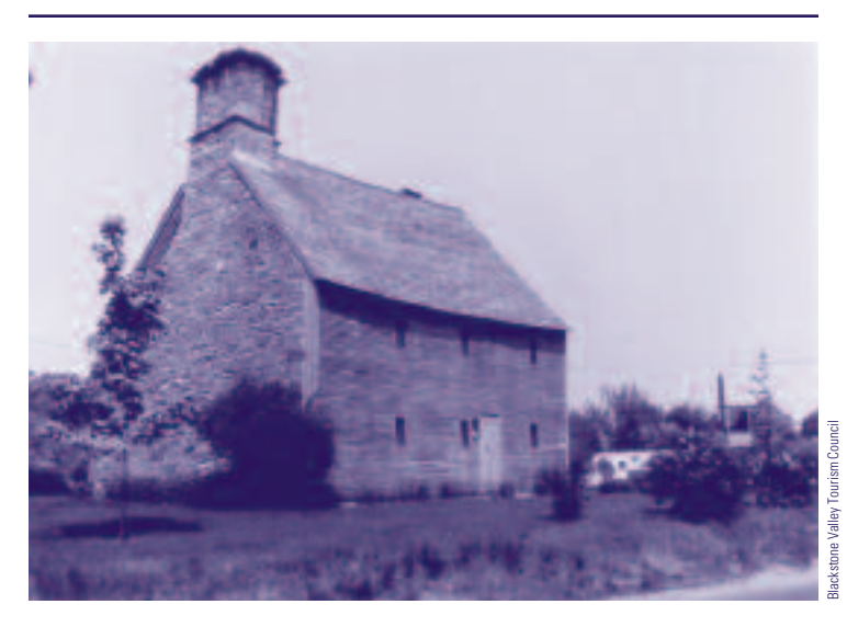
Eleazer Arnold House c. 1687.

Total distance of the tour is 3.25 miles. Driving Tour time is about one hour.