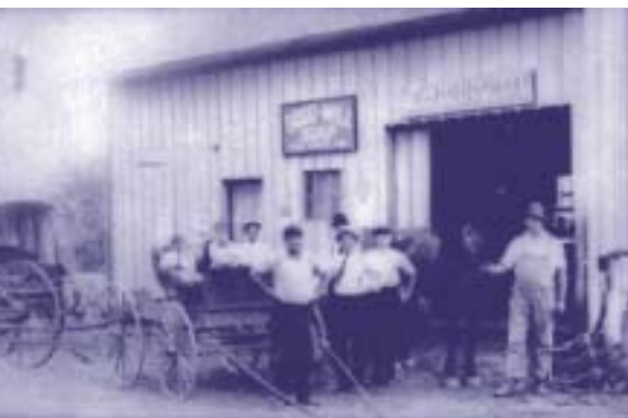
Town of Lincoln

Proceed west 3/10 of a mile to the Moffett Mill.