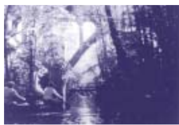
Blackstone River Valley National Heritage Corridor

Activities in Lincoln are not limited to Great Road. Here are some canoeists enjoying a ride through the Blackstone Canal at the Blackstone River State Park. The Blackstone is a popular destination for canoeists and kayakers. For more information and suggested tours, please see the "Get on the River" page of our website.