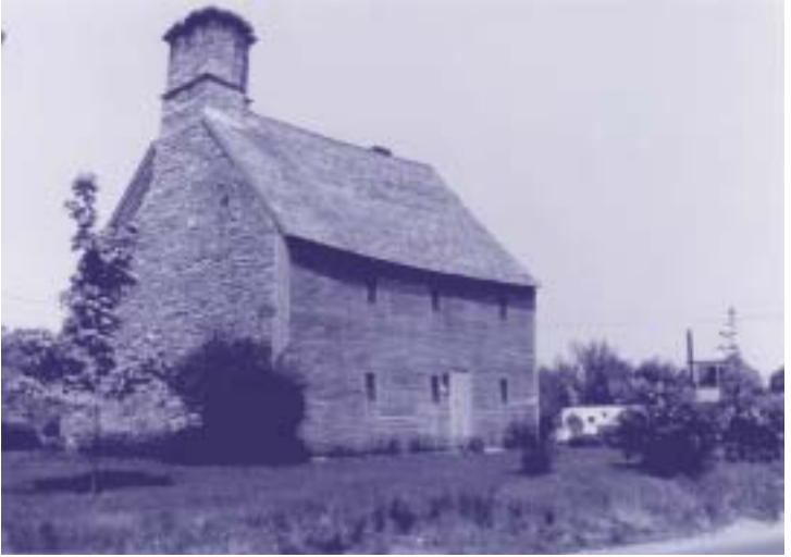
Blackstone Valley Tourism Council

Total distance of the tour is 3.25 miles. Driving Tour time is about one hour.