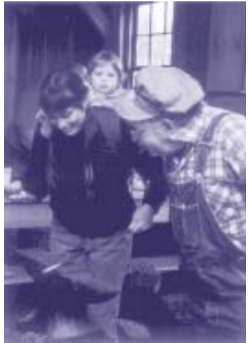
Town of Lincoln

Adjacent to the Chase Farm is the Hannaway Blacksmith Shop. Originally