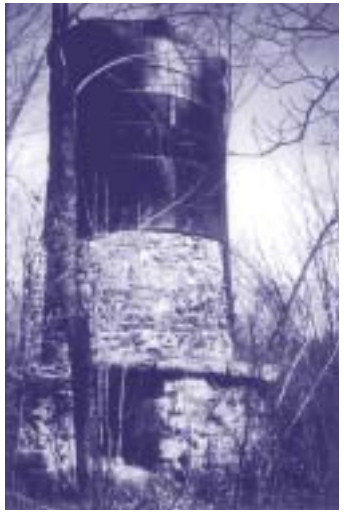
Blackstone River Valley National Heritage Corridor

Follow Great Road to the intersection with Wilbur Road, take the right fork and continue northwards for about 4/10 of a mile.