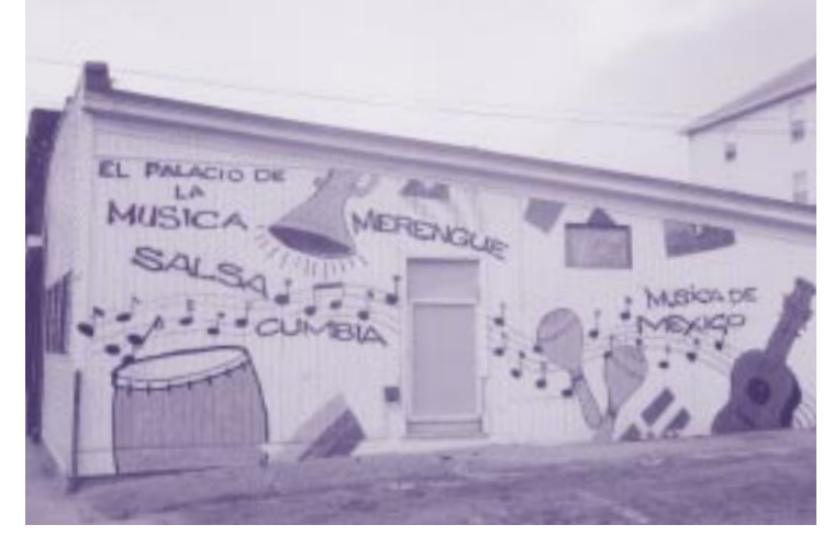
El Palacio De La Musica Mural: Dexter Street.

Turn right onto Dexter Street. Turn right onto Hunt Street then right onto High Street. Continue on High Street to Pierce Park which is on the left side.